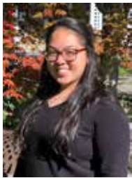
Case Management Intern